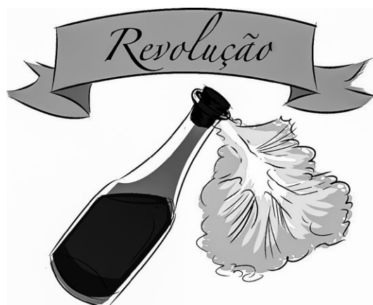
FIGURE 3.

Designers, photographers, and other artists rapidly captioned photos and images, developing an aesthetic with references to other social movements, from Occupy to Gezi. Their Tumblrs offered meme-ready graph-