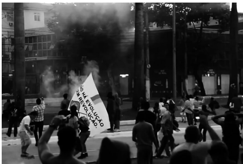
FIGURE 2. Protestors facing off against police. One carries a banner “There is no evolution without revolution,” and several are filming with their cell phones. Still frame, captured from A Partir de Agora—As jornadas de junho no Brasil . Carlos Pronzato CC BY 3.0 BR.

The protests in June and July 2013 took many people by surprise for their size, their energy, and the fact that they happened at all (Figure 2). That they were not sponsored by a political party, the labor unions, or the church, as well as the way that the invitations to participate were