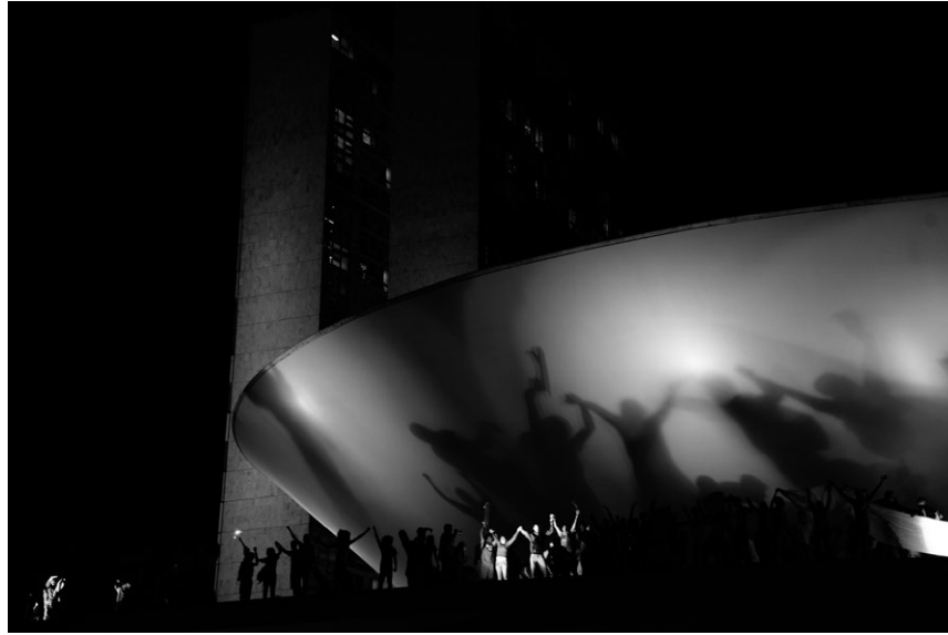
FIGURE 6. Protestors gather atop the National Congress building in Brasilia.

aftermath demonstrated that new media technologies are part of the affective way that power operates now. The transformative potential of the protests, perceived by the ninjas, among others, and advanced through their aesthetic politics, effectively catalyzed new actors across the political spectrum. The new media technologies played as much a role in the polarization and ideological hardening of movements after 2013 as in their earlier buildup, however, with the filter bubble of Facebook and the messaging service WhatsApp (acquired by Facebook in 2014) facilitating a highly insular sociality.