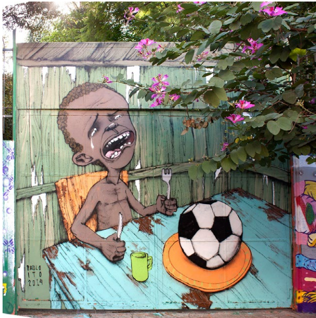
FIGURE 1. "evento da pompéia 2014." Art and photo by Paulo Ito CC BY-NC-ND 2.0.

service of a transformative politics. The awakening and empowerment this facilitated among Brazilians were not inherently progressive. Mixed in with demands for transportation, education, and reform of the political process were calls for military intervention and even the return of the dictatorship. Yet this analysis suggests that the activists took up new media technologies as a kind of equipment that could generate new relationships and subjectivities, and thereby access to intentionally undetermined futures.